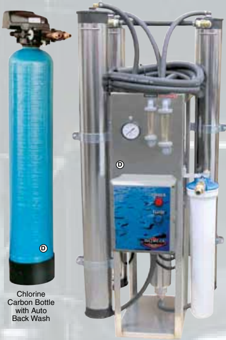
Chlorine Carbon Bottle with Auto Back Wash