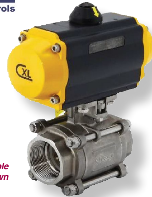
Threaded Ends – Double Acting Actuator Shown