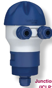
Junction Box (ICLP100)