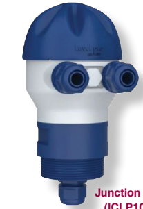
Junction Box (ICLP100)