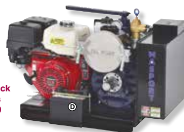
Pro Pack Plus 2500