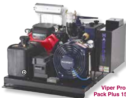
Viper Pro Pack Plus 1500