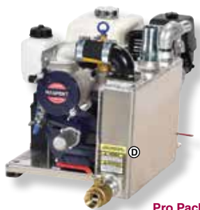
Pro Pack 750/1000

Many Masport vacuum pumps are offered in package systems identified as Pro Pack and/or Pro Pack Plus (Complete). Both options have a Honda engine (electric start) as the drive option (other engine drive options available – call for specifications) pump packages which are mounted onto a base plate. The Pro Pack is a basic system that includes vacuum pump, electric start Honda engine, battery, and remote-mounted oil reservoir. The designation of the “Complete” or the Pro Pack “Plus” system(s) identifies all basic system components with the addition of pressure and vacuum relief valves, pressure/vacuum gauge, inlet filter, scrubber, and separator/muffler – unless otherwise noted. Please call with specifications for more product inquiries – not all available product options are listed. 1-Year performance warranty on Masport vacuum pumps.