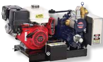
Pro Pack Plus 1500