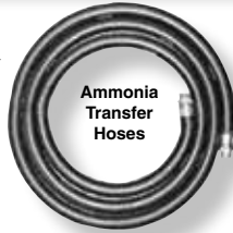
Ammonia Transfer Hoses

N2595 is a super premium hose with an 8-Year removal date, 8-Year service life and an 8-Year prorated warranty. Butyl tube and black neoprene cover. Stainless braid. Not for industrial use.