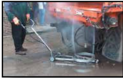
80611 & 80612

Hurricane and Hurricane Pro UnderCarriage Cleaners from Mosmatic. Ideal for use on trucks, cars, fleet vehicles, construction equipment, transport vehicles and more. A great accessory for your hot or cold water pressure washer. Easily reach those hard to get to areas on the underside of most vehicles. Protecting the life of just one vehicle oil pan can easily pay for the cost of these units.