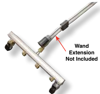
Wand Extension Not Included

Water Broom for cleaning vehicle undercarriages. 16" Overall length with (4) nozzles. Rated to 3 GPM and up to 4,000 PSI. Includes 1/4" quick disconnect plug. Use trigger wand and extension from your pressure washer. Standard with (2) Swivel caster wheels.