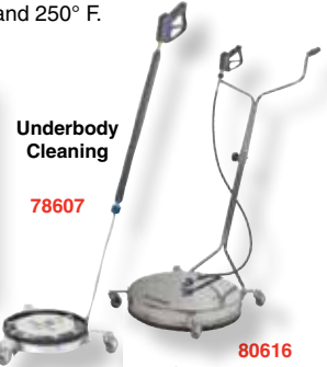
Underbody Cleaning 78607