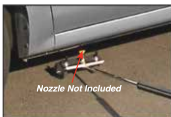
Nozzle Not Included

Undercarriage Cleaner is ideal for cleaning the underside of vehicles, trucks, agricultural equipment and more. Designed for one quick attach nozzle matched to your pressure washers output. 3" Caster wheels allow for easy access and movement. Includes 48" extension. (Trigger wand not included). Rated to 6 GPM and 5,000 PSI. Nozzle plate is stainless steel. Overall length is 52". QCMEG nozzle is not included.