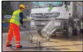
80617 & 80618