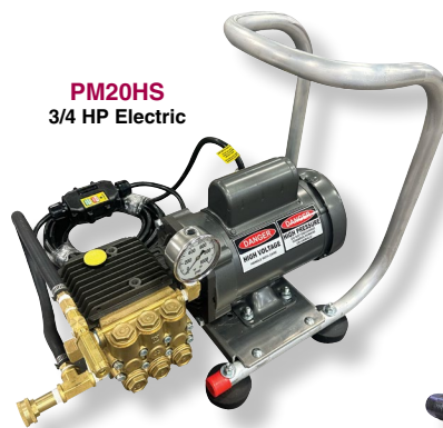
PM20HS 3/4 HP Electric

Designed to test the integrity of pipes and plumbing system required by local codes. Ideal for use with sprinkler systems or sewer lines. All units feature hand carry carts except