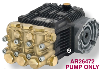
AR26472 PUMP ONLY

This Hydraulically-Driven Pressure Washer is designed for remote and explosion-proof environments where electricity cannot be used. The ideal choice for use with washdown and cleaning of construction equipment, agricultural equipment, concrete cleanup, etc.