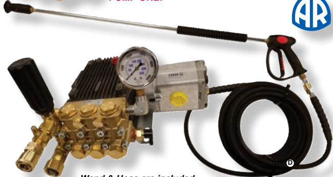
Wand & Hose are included

Kit is complete with hydraulic motor, AR plunger pump, mounting rails, unloader valve, chemical injector pressure gauge, and quick disconnect for hose. Models come with spray wand and 50' hose as shown. A wide variety of flows and pressures are available to meet your needs. Ports are 1/2" FPT x 3/4" FGHT inlet and 3/8" female quick disconnect outlet. Rated to 140° F.