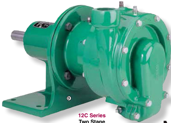
12C Series Two Stage Centrifugal Pumps

Pump casing is high tensile gray iron. Pump shaft is 416 stainless. Mechanical shaft seal is rated to 75 PSI inlet pressure and 220° F. Pumps are pedestal style without motors but we can supply motor, base and drive couplings if required. Drive speed is 3450 RPM. Pump shafts are 1-1/4".