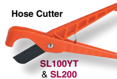
SL100YT & SL200

The perfect tools for cutting hose, tubing or plastic pipe. Enables you to get a smooth, straight cut every time.