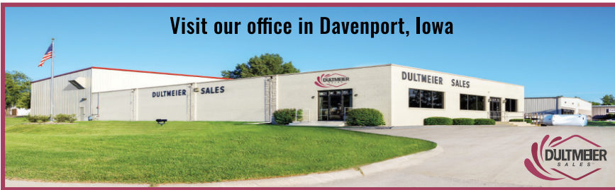
Visit our office in Davenport, Iowa

601 West 76th St. Davenport, IA 52806 1-800-553-6975 • 1-563-386-0930 FAX: 1-563-386-5448