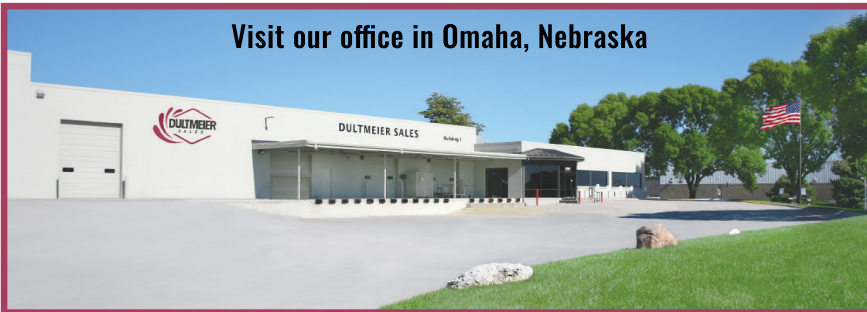
Visit our office in Omaha, Nebraska

13808 Industrial Road Omaha, NE 68137 1-800-228-9666 • 1-402-333-1444 FAX: 1-402-333-5546