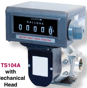
TS104A with Mechanical Head

TS Series of "Stealth" Oval Gear Meters are designed for minimal wear, reliable accuracy, and reduced operating costs – offering precision performance for a wide array of high-volume liquid transfer applications. Easily maintained over the life of the meter due to minimal moving parts. Stainless oval gear meters are suitable for ag chemicals and fertilizers, while aluminum oval gear meters are designed for handling refined fuels. Legal for direct resale (NTEP Certified) on most of these recommended products – Call to verify!