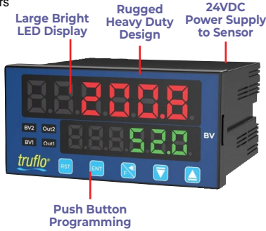
ENC-100 NEMA 4X Enclosure (Optional) + PMD Display