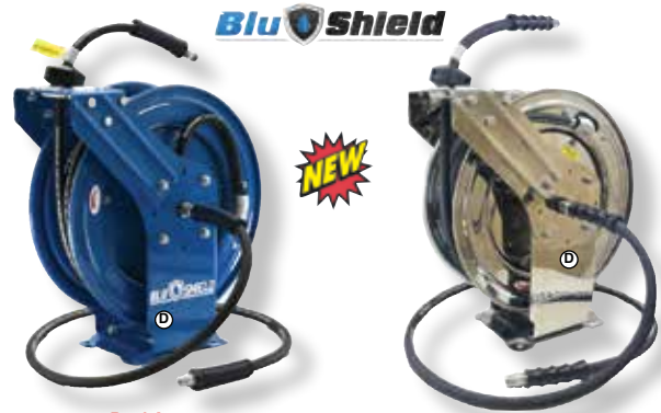
Dual Arm 18GA. Powder-Coat Steel

BluShield hose reel packages from BluBird feature high pressure, wrapped-cover hoses with Kevlar braid in black or "non-marking" grey. Aramid/Kevlar braided hoses are 35% lighter and yet 5 times stronger than standard wire-braid hose. Rated to 4100 PSI and from -20° F to +250° F.