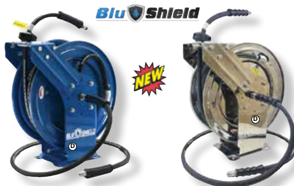
Dual Arm 18GA. Powder-Coat Steel

BluShield hose reel packages from BluBird feature high pressure, wrapped-cover hoses with Kevlar braid in black or "non-marking" grey. Aramid/Kevlar braided hoses are 35% lighter and yet 5 times stronger than standard wire-braid hose. Rated to 4100 PSI and from -20° F to +250° F.