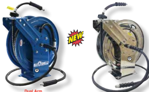
Dual Arm 18GA. Powder-Coat Steel

Compact design. Reels with 50ft hoses are 16-1/4" high x 6" wide x 17 1/2" deep. Reels with 100ft hoses are 19-3/4" high x 7-1/2" wide x 19-1/2" deep.