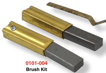
0101-004 Brush Kit