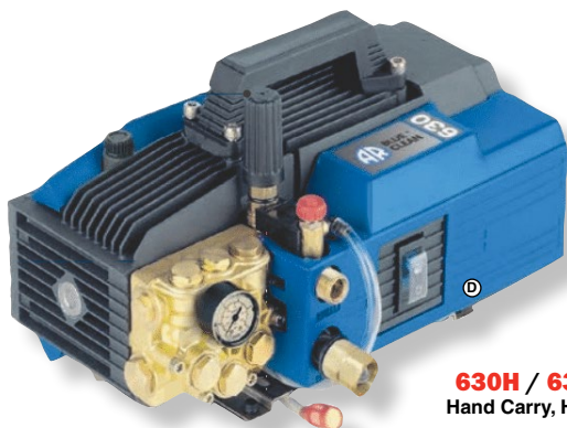
630H / 630TSSH Hand Carry, Hot Models

inspectable water intake filter with GHA