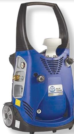
767 Wheeled Cart Model