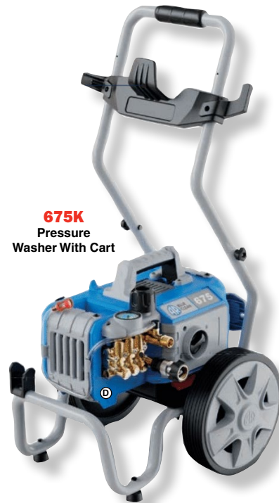
675K Pressure Washer With Cart