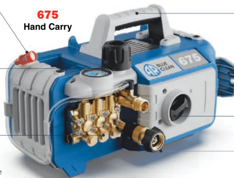
675 Hand Carry

brass head pump with pump oil discharge valve