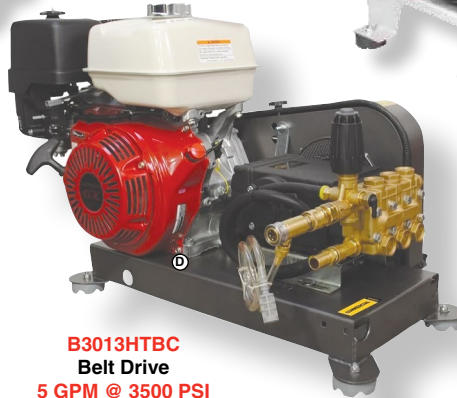
B3013HTBC Belt Drive 5 GPM @ 3500 PSI