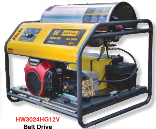
HW3024HG12V Belt Drive Powder Coated Skid