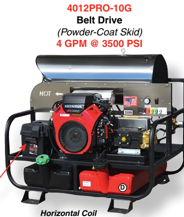
4012PRO-10G Belt Drive (Powder-Coat Skid) 4 GPM @ 3500 PSI