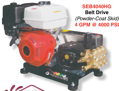
SEB4040HG Belt Drive (Powder-Coat Skid) 4 GPM @ 4000 PSI

All models feature Triplex Plunger Pumps with Honda Gas Engines . Skid bases for trailer or frame mount. Belt or Direct Drive as noted. Pressure regulating valves. Hot water units also include 12Volt burners for #1 or #2 diesel or kerosene. Schedule 80 coils, adjustable thermostats, gas and fuel tanks, batteries.