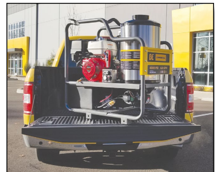
HW4013HGS Vertical Design - Belt Drive 4 GPM @ 4000 PSI

# Battery not included this model but standard on all others