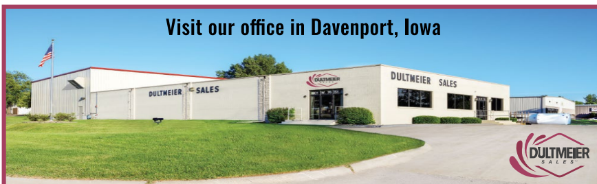
Visit our office in Davenport, Iowa

601 West 76th St. Davenport, IA 52806 1-800-553-6975 • 1-563-386-0930 FAX: 1-563-386-5448