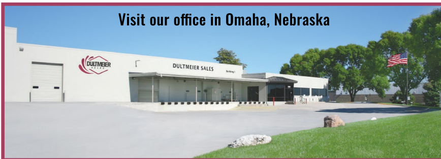
Visit our office in Omaha, Nebraska

13808 Industrial Road Omaha, NE 68137 1-800-228-9666 • 1-402-333-1444 FAX: 1-402-333-5546