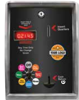
Coin / Token or Coin / Token / Credit