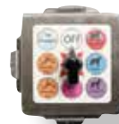
Manual Switch Box (Optional)