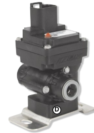
Mounting Brackets Shown are Not Included

3/8" ZIPVALVE 2-way ball valves available with 1/2" dual O-ring push-to-connect and/or QD fork fitting connections. They have a flow rate of 11.2 GPM (@5 PSI drop) and a maximum PSI of 150 @ 70° F. 3/8" Stainless steel valves include 3/8" FPT ends and a maximum PSI of 600. Valves come standard with positive at close feedback.