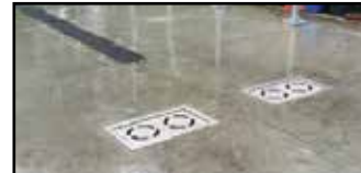
Stainless Undercarriage Pans in Concrete