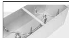
Stainless Undercarriage Pans & Nozzles