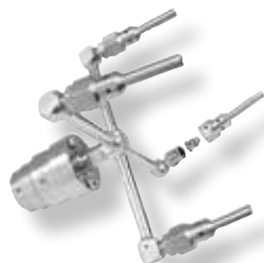
Unique High Impact Stabilizer Nozzle Assemblies