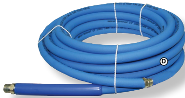
1500-25BL Blue Hose Assembly

Perfect for most cold water pressure washer and cleaning applications up to 140° F. Available in 3/8" black or blue fitted assemblies with 3/8" MPT solid x 3/8" MPT swivel ends and 2 bend restrictors. Also available in 1/4" size with M22 ends as common replacements for many of the smaller pressure washers sold in the market.