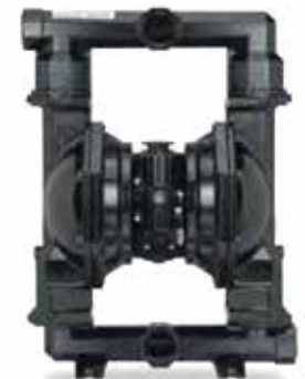
2" FPT ALUMINUM