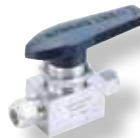
SBV120H 3,000 PSI