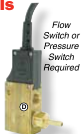
Flow Switch or Pressure Switch Required

Designed for use with a wide variety of Prep Units and Pump Systems to automatically shutdown pump and motor when trigger guns are shut-off. Systems include a delay timer for shut-off to occur when you want it, ( i.e. 20 seconds, 1 minute, etc. ). All panels include motor starters, hour meter, multi volt transformer and relays. 14" x 12" gasketed enclosure ( manual disconnect ). Pre-wired prior to shipment. U.L. listed.