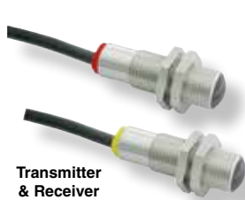
Transmitter & Receiver