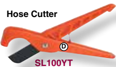
SL100YT & SL200

The perfect tools for cutting hose, tubing or plastic pipe. Enables you to get a smooth, straight cut every time.