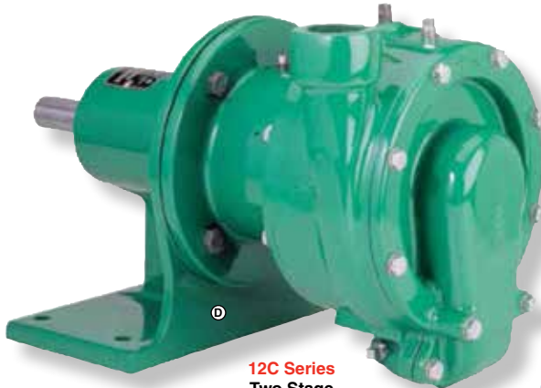
12C Series Two Stage Centrifugal Pumps

Dual impellers are bronze construction ( Iron also available ). Pump casing is high tensile gray iron. Pump shaft is 416 stainless. Mechanical shaft seal is rated to 75 PSI inlet pressure and 220° F. Pumps are pedestal style without motors but we can supply motor, base and drive couplings if required. Drive speed is 3450 RPM. Pump shafts are 1-1/4".