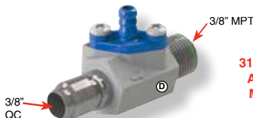
311 QC Series Available in Most Sizes

Rocket Chemical Injectors from Dema. Stainless steel bodies with polypropylene inserts, teflon balls and Hastelloy springs for strength and added chemical resistance. Color coded inlet barbs allow for different products at different flow rates. Single, dual barb and quick coupler design for injection of one or two products. Designed for use with metering tip kits for a nearly unlimited injection rates. Easy, field repairable design. Interchangeable with many commonly used injectors. Rated to 1000 PSI. * QC will fit standard quick couplers, but will not interchange with Hydrflex.