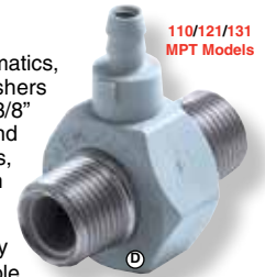
110/121/131 MPT Models

Innovative Chemical Injectors for use with Automatics, Self-Serve Systems and even pressure washers applications. 3/8" MPT x 3/8" MPT or PQC x 3/8" MPT stainless steel inlet and outlet ports and PVDF/Kynar injection bodies with Teflon o-rings, ensure the highest chemical and corrosion resistance available.