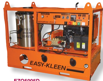
EZ05005D Diesel Engine