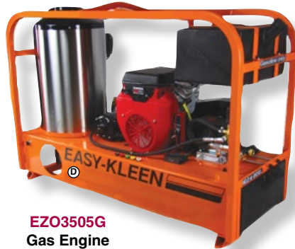
EZ03505G Gas Engine

Standard Features: Belt driven, General Plunger Pumps • Adjustable pressure regulator • Pressure gauge • Chemical injector • 50' Hose • Trigger gun and 48" wand • 5 Spray nozzles • Schedule 80 and 160 coils sealed with ceramic blanket and stainless wrap • 12 Volt oil burner with cleanable fuel filter • Gas units have (1) 20 gallon fuel tank & Diesel units have (2) 20 gallon tanks • 11 Gauge and 3/16" plate steel frame with 1-1/2" steel tubing • Powder-coated finish • 5 Year pro rated coil warranty.