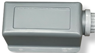
75649 SAFETY CONTAINER

AS A SAFETY PRECAUTION WATER SHOULD BE CARRIED ON AMMONIA APPLICATORS & NURSE TANKS