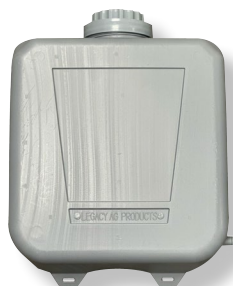
76411 SIDE MOUNT