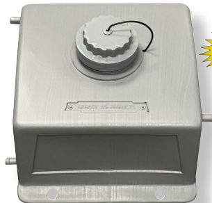
76410 TOP MOUNT