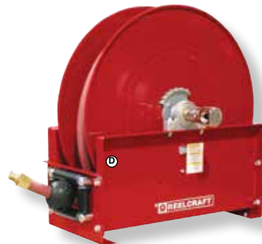
FD93 / FD94