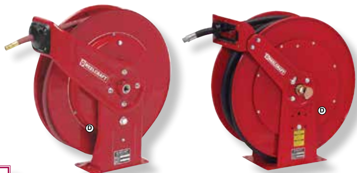
F79 / UR78 / UR79

Viton® is a registered trademark of DuPont Performance Elastomers