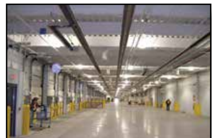
Distribution Facilities / Warehouses