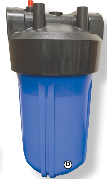
WF4124 "Big Blue"