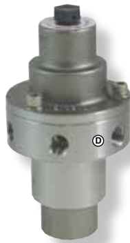
3/4" Inlet 1/4" Outlet