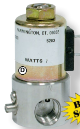
3X293 Side Meter

Maximum operating pressure differential is 150 PSI. Ports are either 1/4" or 1/8" FPT. Standard valves are 2-Way, normally closed. UL listed.