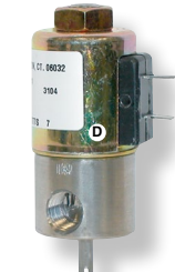
249014-023101 Bottom Meter

3X293 & 3X529-10 have a Stainless Steel metering screw incorporated into the side of the body and are designed for individual use.