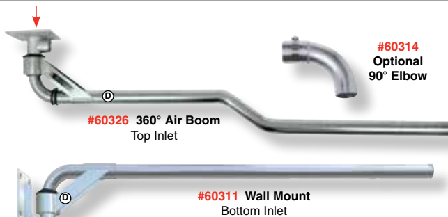
#60326 360° Air Boom Top Inlet