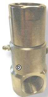
25171 90° Swivel