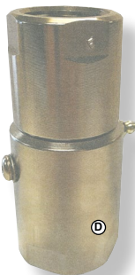
16091 Inline Swivel

These 1 Inch Inline and 90° Swivels from Super Swivels are designed to retrofit into some of the most popular high pressure automatics, like PDQ and Washworld. Nickel-plated steel construction. Rated to 3,000 PSI and 400° F.