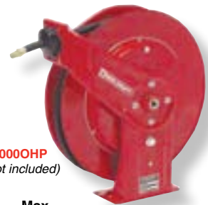
PW81000OHP (hose not included)

Spring Rewind Pressure Washer Reels from Reelcraft. High quality steel construction with red powder-coated finish. Ideal for use in shops and garages. Rated to 5,000 PSI and 212° F. Designed for 1/4" or 3/8" I.D. hose, (not included). Fast, automatic return of hose into reel drum keeps hose out of the way and off the floor.