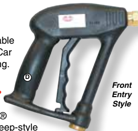
Front Entry Style

Features: Glass reinforced plastic body • Stainless Steel seat insert, ball and actuating rod • Forged brass valve housing • Viton® seals • Available with either zero-leak or weep-style seats • Good balance and light trigger pull • No liquid flow through the handle so 300 degree fluids can be used comfortably • Extremely durable, yet lightweight.