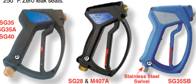
SG35 SG35A SG40

Heavy-Duty, Trigger Wands. Light trigger pull means less hand fatigue. Ideal for car/truck wash, mobile cleaning, pressure wash and industrial cleaning. SG35A can be used for all applications listed above but is also rated for acid solutions. SG35SB is blue food grade with built in stainless swivel. All wands have 3/8" FPT inlet x 1/4" FPT outlet. Rated to 320° F. except M407A which is 250° F. Zero leak seats.