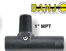
Poly Hose Barb Elbow