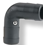
Poly 90° 1" Hose Barb Elbow