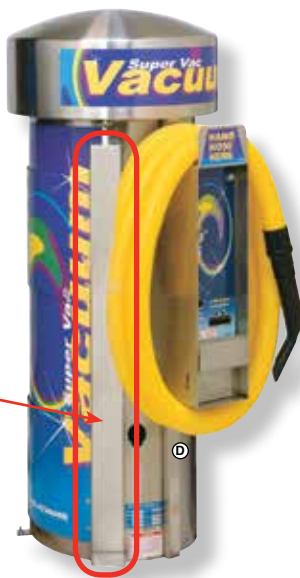
9427K Shown on Vacuum

9427K Dual Service Door Security Cover accommodates all J.E. Adams round two-door vacuums, air/vacuums, air/water/vacuums and two door combination units. Protects and covers door latches for new or existing vacuums.