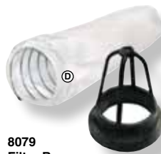
8079 Filter Bag Assembly Complete