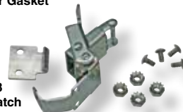
8153 Door Latch