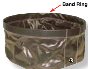
635201 / DC555

Model DC920 is a heavy duty, molded plastic canister. Diameter is 18-3/4" and height is 8". This model can be used on Doyle, Adams and many other vacuums on the market today.