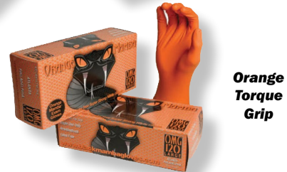
Orange Torque Grip