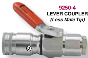
9250-4 LEVER COUPLER (Less Male Tip)

Open Position , locks open the valves in the body and the tip, so they are unaffected by rapid variations in fluid flow. However, inadvertently turning the lever to open without the tip in place will not result in oil flow. Valves will close automatically in case of breakaway.