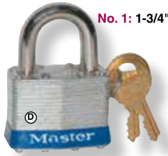
No. 1: 1-3/4"