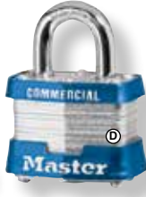
No. 3: 1-1/2"

No. 81 locks feature 5-pin tumbler for added security. Base width is 1-3/4". Shackle diameter is 5/16". Vertical clearance is 15/16", horizontal clearance is 3/4".