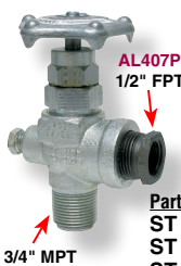
AL407P 1/2" FPT 3/4" MPT