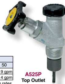
A525P Top Outlet

The A525P consists of a service valve, a filling connection and an excess flow valve.