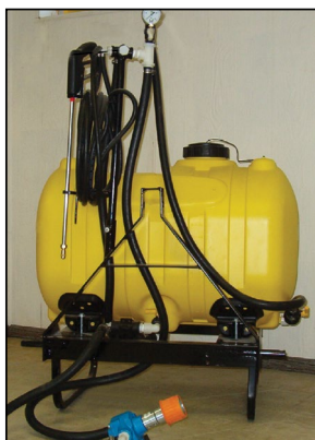
PT60BRM 3-Point Sprayer

PT300C is the same as PTA300R but the regulator kit is set up to work in conjunction with a centrifugal pump, which includes 1-1/4" suction hose, 1" discharge hose and larger fittings and valves. LESS PUMP, BOOM, CONTROL and HAND GUN.