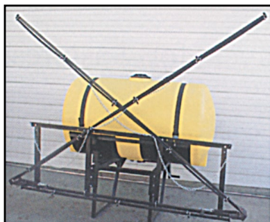
FBS30 Folding "Break-Away" Boom

— Other Pumps & Control Systems Available —