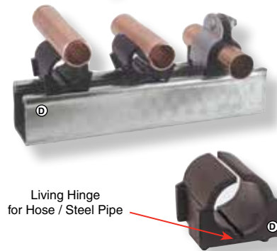
"Controlled Squeeze" Shoulder Bolt