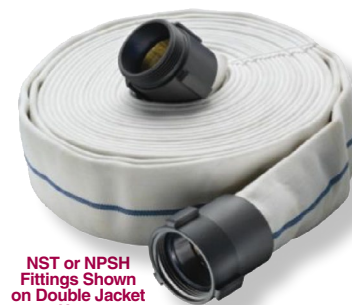
NST or NPSH Fittings Shown on Double Jacket Hose

Single or Double Jacket Mill Hose Assemblies is with banded C & E Aluminum Camlock Cover Couplings. NST, or NPSH rocker lug style fittings. Ideal for water discharge and wash down. Immune to the effects of mildew - requires no drying. Will not rot - even if hose is stored wet. All synthetic - 100% polyester yarn white cover, rubber lined. Double Jacket used where extra abrasion-resistance or higher operating pressure is required. Available in 150PSI (Single Jacket) or 200PSI (Double Jacket) pressure ratings. Temperature Rating: -25° F to 185° F. NST and NPSH Fittings are Aluminum Rocker Lug Style.